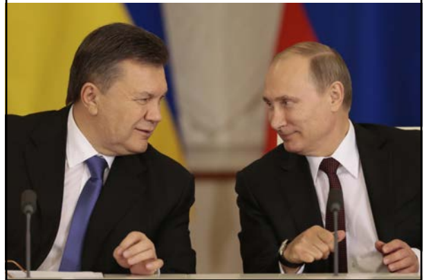
Yanukovich makes agreement with Russia after backing out of EU deal.