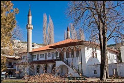
Bakchiserai, home of the Crimean Khanate (1478 to 1774)