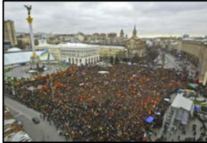
Orange Revolution Ukraine 2004